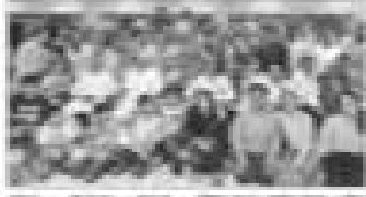
माहेश्वरी समाजाच्या वतीने कोजागिरी साजरी...